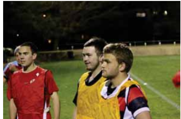
More action back on the field.